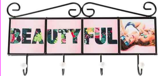
Photo Coat Rack

Coat racks are made from a black steel frame and ceramic tiles. Our printer can achieve complex patterns, beautiful colour and shapes on a coat rack that will amaze you.