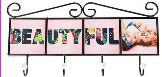
Photo Coat Rack

Coat racks are made from a black steel frame and ceramic tiles. Our printer can achieve complex patterns, beautiful colour and shapes on a coat rack that will amaze you.